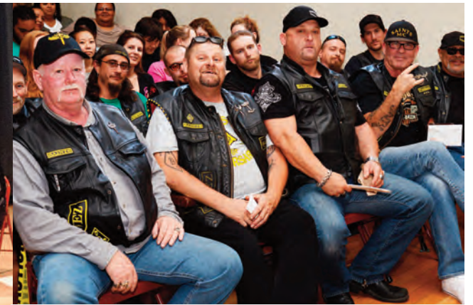
For the 11th year, the Saints Motorcycle Club, raised money for scholarships. The club raised $19,000 for 2015 Vicente/Briones graduates.